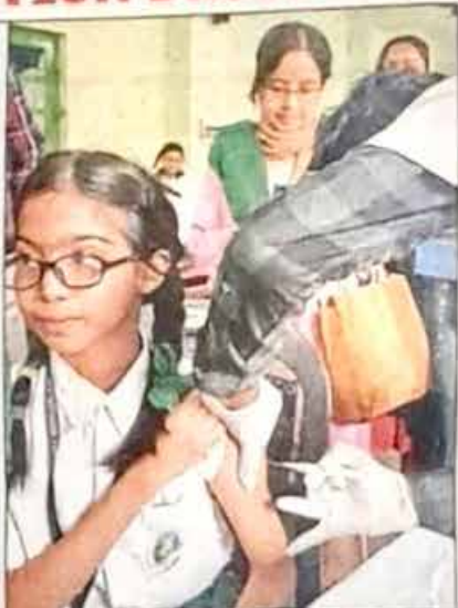
The vaccination drive underway at a city school on Tuesday

Cervical cancer is caused by HPV infection, which is sexually transmitted